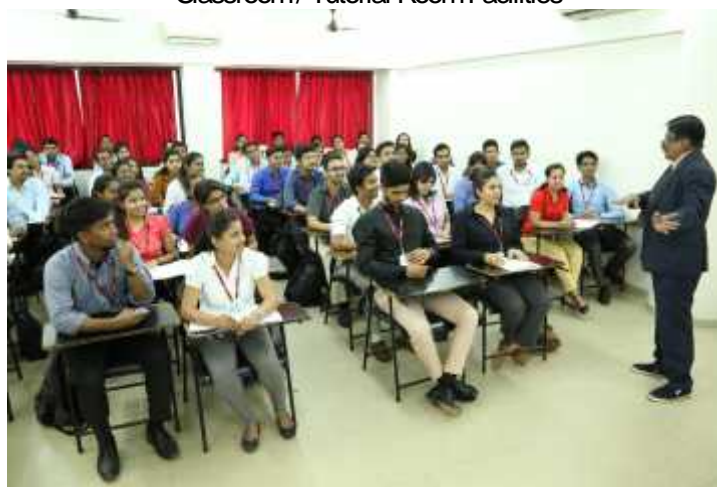
Classroom/ Tutorial Room Facilities