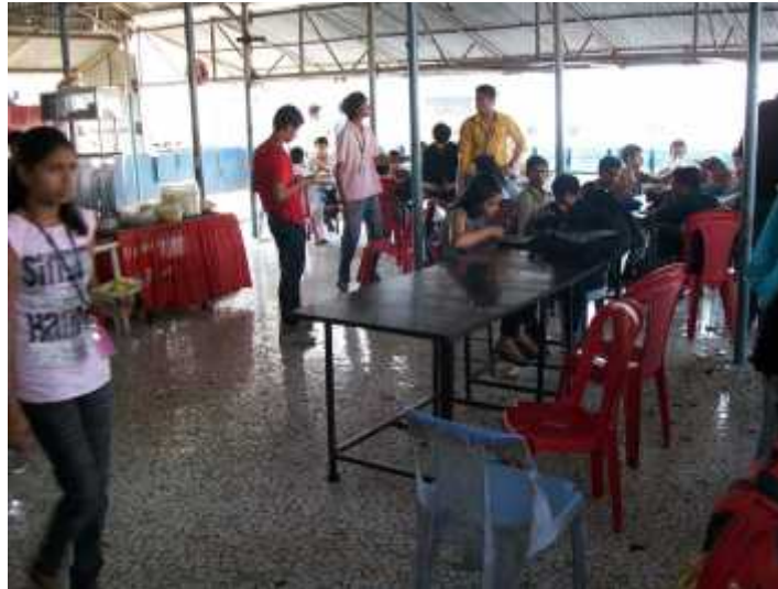
Any other facilities