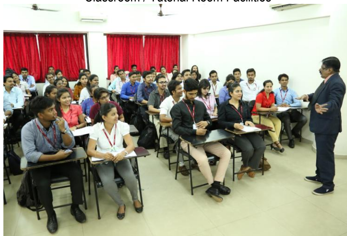
Classroom / Tutorial Room Facilities