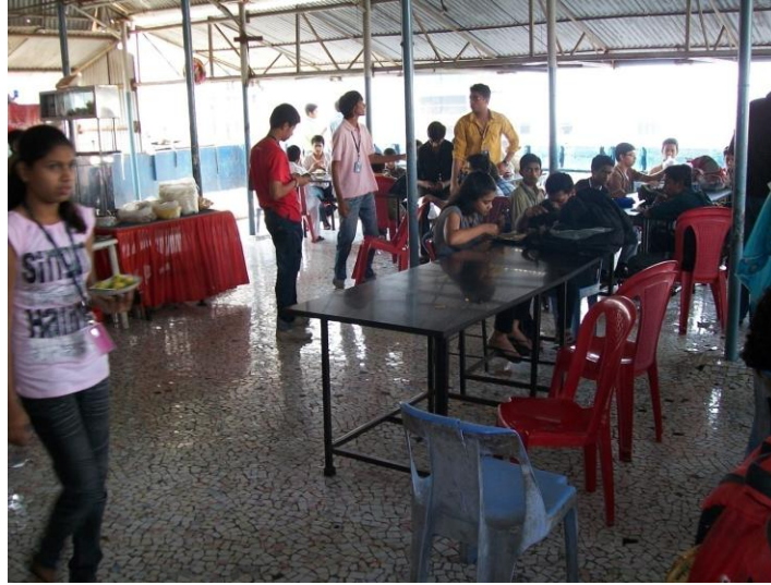
Any other facilities