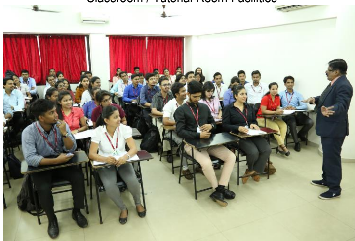
Classroom / Tutorial Room Facilities