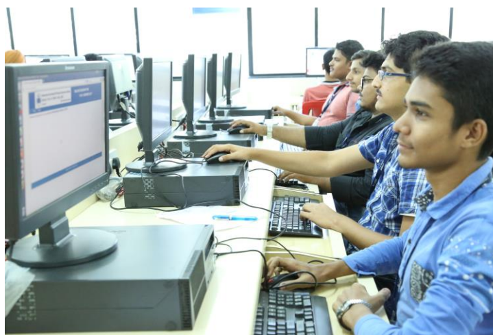
Computer Centre facilities