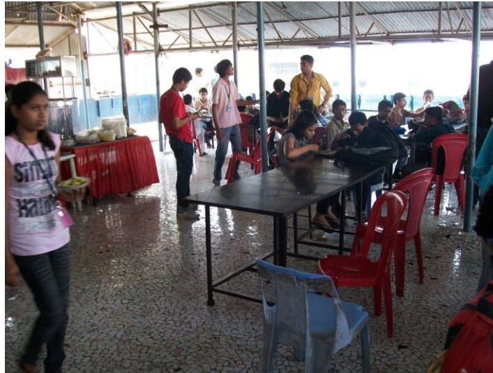
Any other facilities