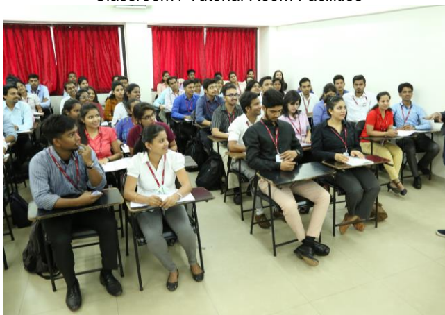
Classroom / Tutorial Room Facilities