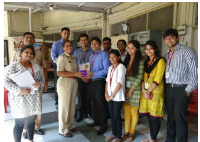
Nagpada Police Station