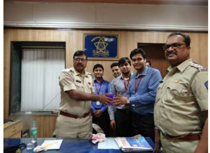
Agripada Police Station