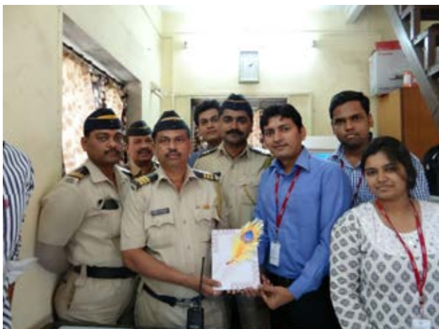
Police Booth, Mumbai Central Station