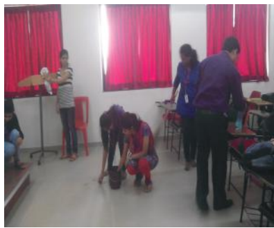
Cleanliness Drive – Swacha Bharat Abhiyaan Birth Anniversary of Mahatma Gandhi