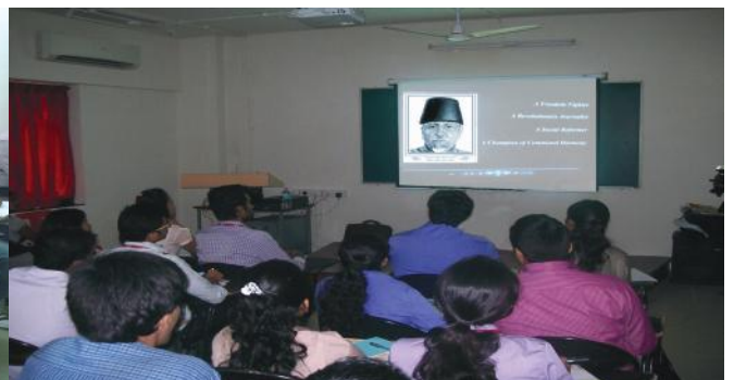
National Education Day Celebration (Birth Anniversary of Maulana Abul Kalam Azad)