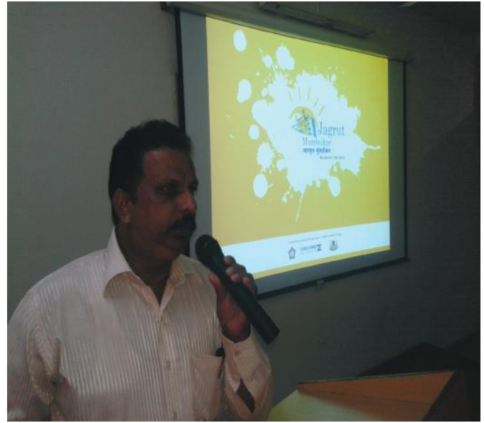
“Alert Mumbaikar” by Team of Protection and Security Department, Mumbai Police