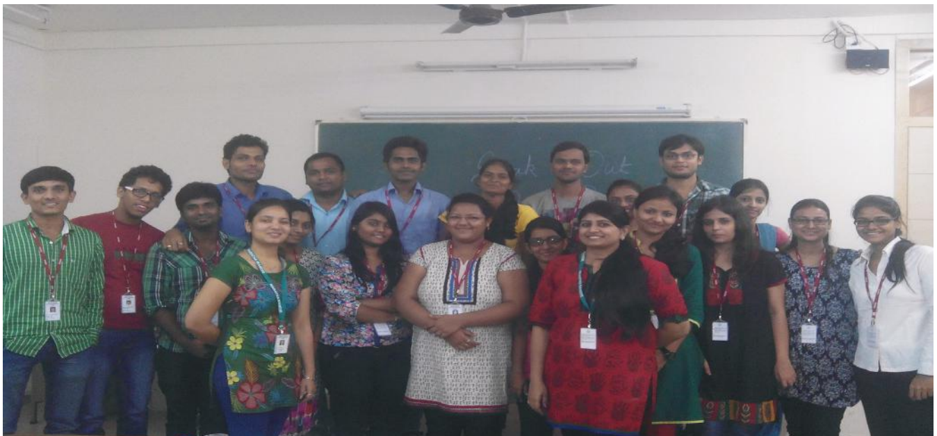
“Speak out Write Right” (Improvement in Communication) Certificate Programme