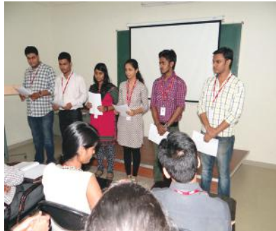
Rashtriya Ekta Diwas Celebration (Birth Anniversary of Sardar Valabh Bhai Patel)

A visionary and founder of Maratha Mandir