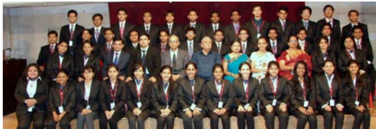
MMS DIV B