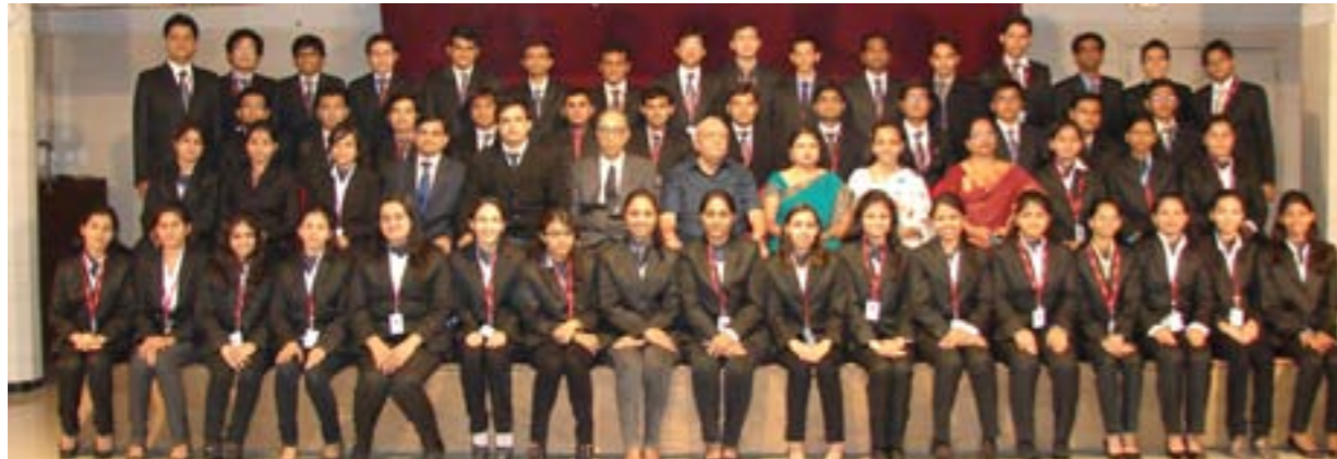
MMS DIV A