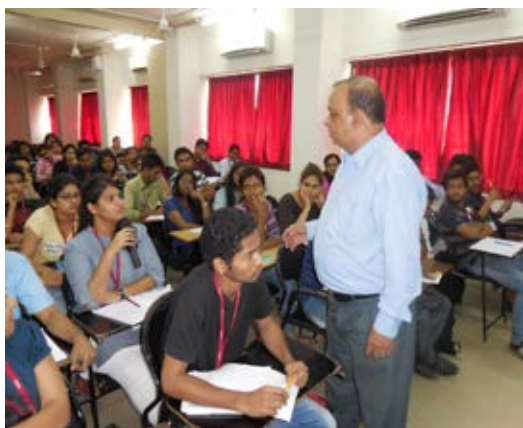
“Tall Claims & Puffery” by Alan Collaco. Secretary General of The Advertising Standards Council of India