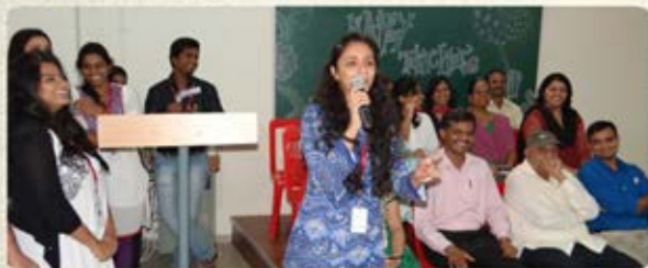
Teacher's Day Celebration