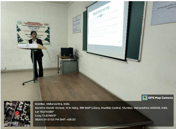
Mumbai, Maharashtra, India Maratha Mandir Annex, M M Marg, RBI Staff Colony, Mumbai Central, Mumbai, Maharashtra 400008, India Lat: 18.970398° Long: 72.821843° 08/04/24 01:20 PM GMT +05:30