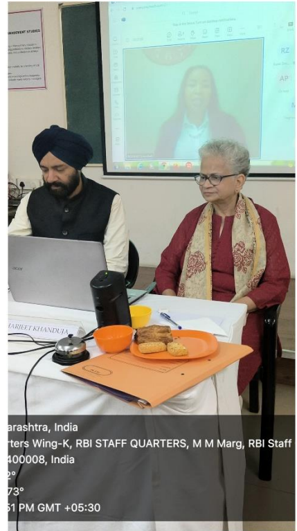
Maharashtra, India Staff Quarters Wing-K, RBI STAFF QUARTERS, M M Marg, RBI Staff 400008, India 29° 73° 1:51 PM GMT +05:30