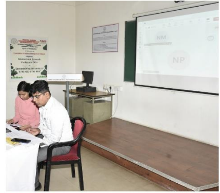
Maharashtra, India Mandir Annexe, M M Marg, RBI Staff Colony, Mumbai 400008, India