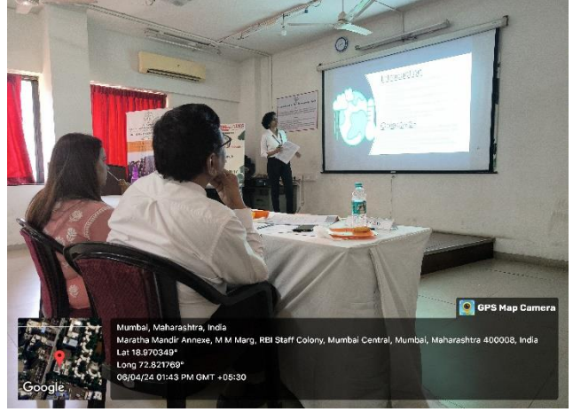
Mumbai, Maharashtra, India Maratha Mandir Annex, M M Marg, RBI Staff Colony, Mumbai Central, Mumbai, Maharashtra 400008, India Lat: 18.970349° Long: 72.821769° 08/04/24 01:43 PM GMT +05:30