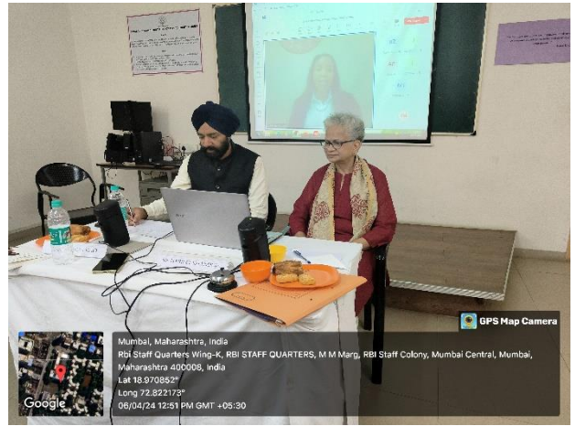
Mumbai, Maharashtra, India RBI Staff Quarters Wing-K, RBI STAFF QUARTERS, M M Marg, RBI Staff Colony, Mumbai Central, Mumbai, Maharashtra 400008, India Lat: 18.970882° Long: 72.822173° 08/04/24 12:51 PM GMT +05:30