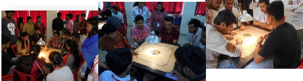
Carrom Competition for SEM-I and III was organized in September, 2018