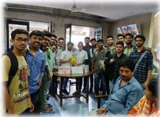
SEM-I students celebrated Thanksgiving Day on 16 th August, 2018 at Nair Dental Hospital. They prepared and gave Handmade cards.