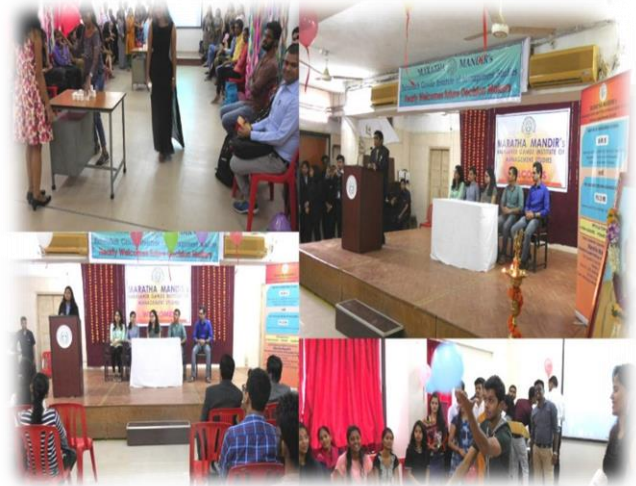
Ice Breaking session for SEM-I was organized on 1 st August, 2018