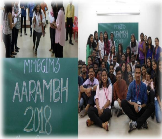
Aarambh for SEM-III was organized on 17 th July, 2018