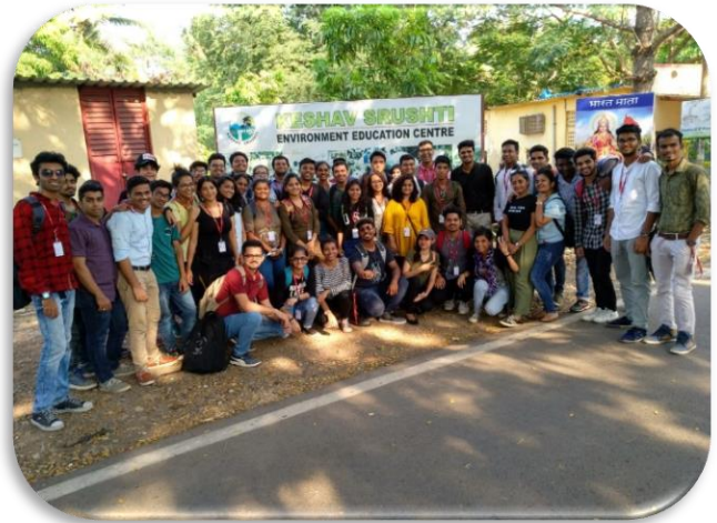
SEM-I students visited Keshav Srushti an Environment Education Centre at Bhayander on 4 th November, 2018