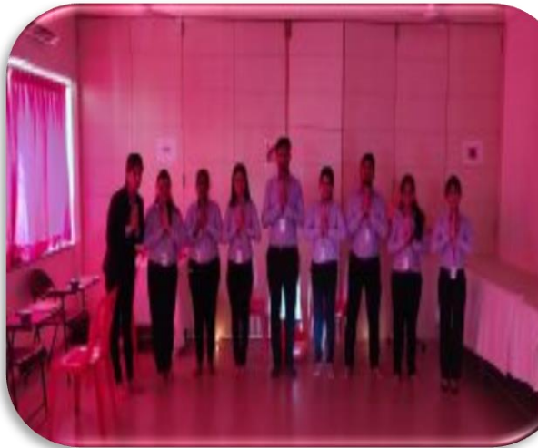
SEM-III Marketing specialization students conducted a Simulation on "SPA" on 8 th October, 2018