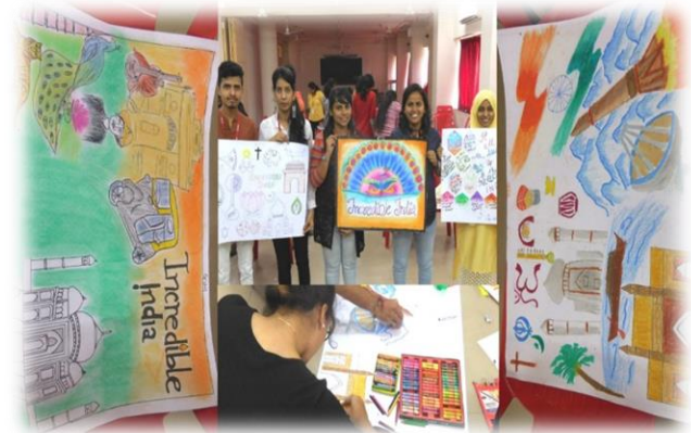
Poster making competition for SEM-III students was organized on 20 th September, 2018